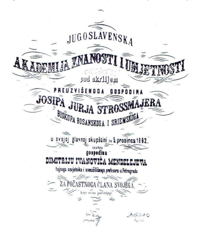
Figure 2. Acknowledgment to Dmitri Ivanovich Mendeleev on election as an honorary member of the Yugoslav Academy of Sciences and Arts in 1882.

Following the abolishment of the Jesuit Zagreb Royal Academy of Science and its Philosophy Course in 1850, high school natural science classes have not been held in Croatia for over quarter of a century. These classes were taught within real-high school curriculum. Due to political Bach's absolutism (1852 – 1859) the classes were held in German language only, and German textbooks were used. On 27 September 1861, the Croatian Parliament decided to print and publish Croatian textbooks, and to introduce Croatian language into education system. The first original chemistry textbook in Croatian language, Obća kemija za male realke ( General Chemistry for Junior Real-High Schools ), was published in 1866.<sup>[15]</sup> Its author, Pavao Žulić (1831 – 1922),