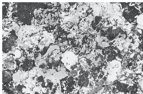
Figure 1 Symptoms of green mould disease in the button mushroom compost

DNA was extracted from the isolates, and the ITS regions were amplified by PCR. The amplicons were subjected to automatic sequencing (external service), and the DNA sequences analysed by TrichOKEY v. 2.0 software (22, www.isth.info). All the 20 isolates collected from the button mushroom compost were identified as T. harzianum , while strains isolated from the oyster mushroom substrate included T. pleurotum and T. pleuroticola (9 and 11 isolates, respectively). Alignments (20) revealed that the ITS sequences of the isolates belonging to the same species did not share the same pattern. The differences suggested that they belonged to different strains within the species, but this did not affect the results of identification.